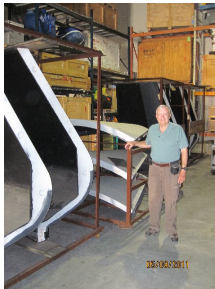
A CEV or Crew Exploration Module mockup at JSC that was being scrapped. John and I have also cornered some of the Space Shuttle items at Michoud that they were planning on scrapping.

We hope to live off the revenue from the restaurant and gift shop to cover the minimal overhead in the interim. We knew fund raising was going to be a real challenge but the combination of factors such as the economy downturn and oil spill have almost made it Mission Impossible! Have a great Day, Fred Haise