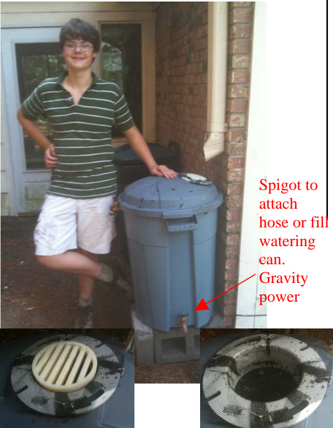
Spigot to attach hose or fill watering can. Gravity power