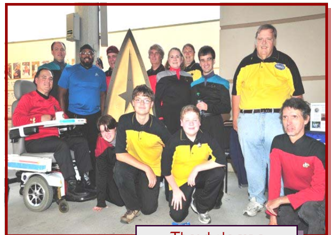
The whole gang