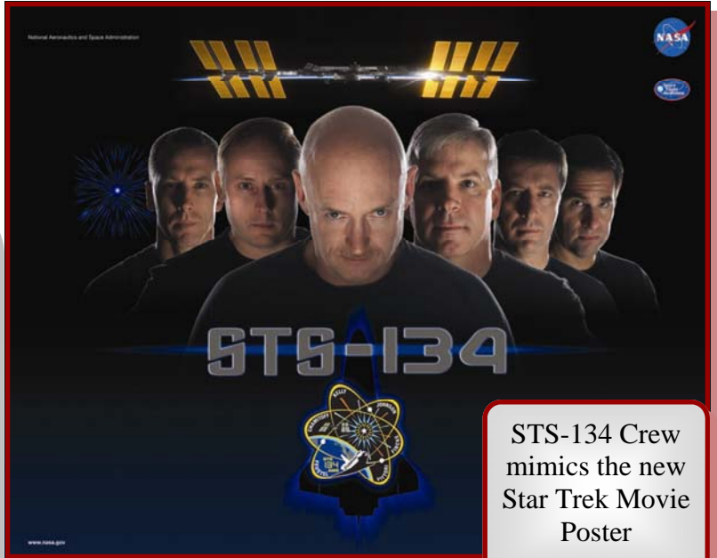
STS-134 Crew mimics the new Star Trek Movie Poster

THE COMMLINK is the newsletter of the U.S.S. Haise. Opinions expressed herein are strictly the opinions of the U.S.S. Haise. Star Trek , TNG , DS9 , Voyager , and Enterprise are registered trademarks of Paramount Pictures Corporation (a division of Paramount Communications ), Viacom, Inc. , and/or the Estate of Gene Roddenberry. All rights thereto are reserved by them or by their respective licensees. Our use of these trademarks is intended to be for a "fair use" only as permitted by applicable law, and no claim of ownership or infringement is intended or implied. This publication and this fan organization are both "not-for-profit."