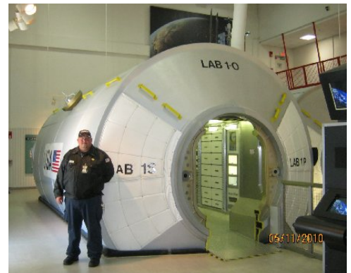
A full scale Space Lab from KSC that we managed to get first dibs on. They are redoing this whole area for a new Space Station exhibit.

Full opening is indeterminate. We do not have the funds to go out for the bids on the exhibits. The building will be complete in about 3 months with an operational restaurant/kitchen and gift shop area complete with shelving. The initial plan is to move in some NASA artifacts, including ones John Wilson and I have scrounged. Also some displays, including one showing artists renderings of what is coming with the completed museum. We will contract out the restaurants & gift shop (for % of earnings) to cover a minimal overhead while acquiring the funding needed. We are working to get a loan, not the way we hoped to do it but all fronts have shut down for major sources of revenue. Take care, Freddo